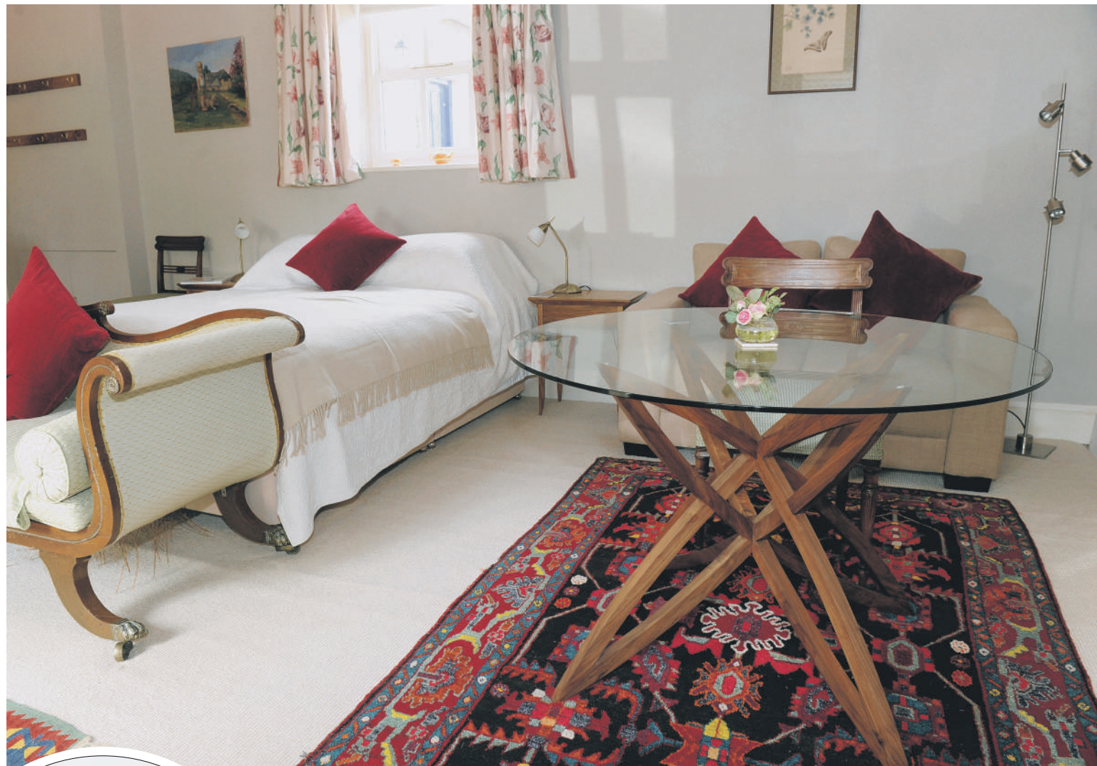
DESIGN SKILLS: Sam Anderson designed and built the cabinets for the kitchen, which is in converted farm buildings, main picture; Sam's Star table adds wow factor to the B&B room, above; Sam Anderson Fine Furniture Spectrum tables/stools in walnut from £210, inset.